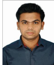
20M135 RAGU M