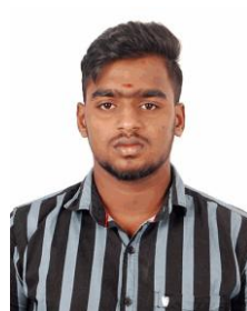
20M137 RAMAN N