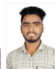
20M142 SELVENDRAN B