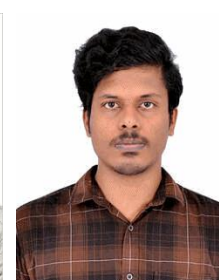
20M146 VELAYUTHAM I