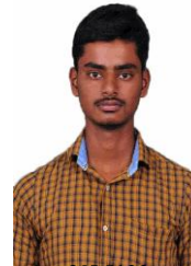
20M122 MADHISHR AJ