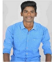
21M610 RUBAN R