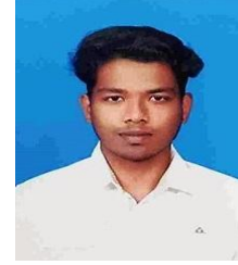
20M202 ABISAK S