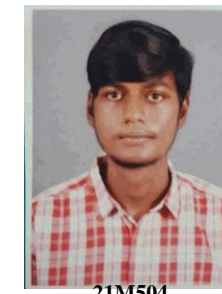
21M504 ALLANTHERES H