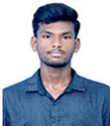
20M240 AKTHIVEL R