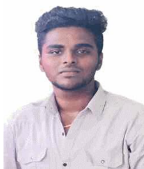
20M120 KUSELAN S