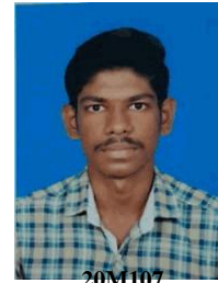
20M107 DHANUSHKU MA