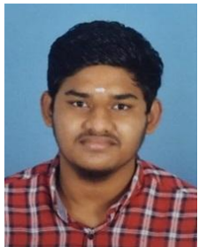
21M617 VIBILASH S