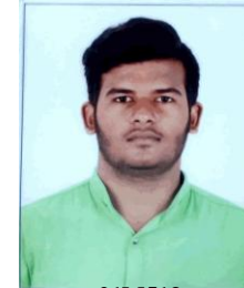
21M513 MATHANARAH U