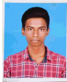
21M509 JOBNIGIL P