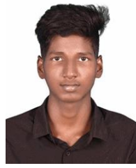
20M113 GURUGANES H S