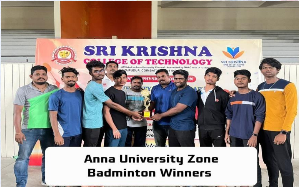
Anna University Zone Badminton Winners