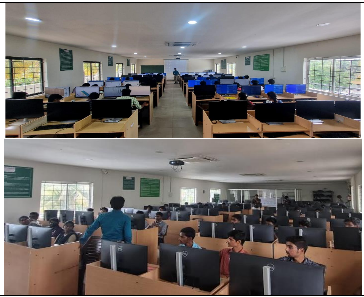
Fig.6: Glimpses of one day national level workshop organised by the department of civil engineering on the topic "Design of Structural Elements using Tekla Structures" on 12<sup>th</sup> October 2023.

Department of Civil Engineering organized a Guest Lecture on "Building Information Modelling" on 19<sup>th</sup> October 2023.