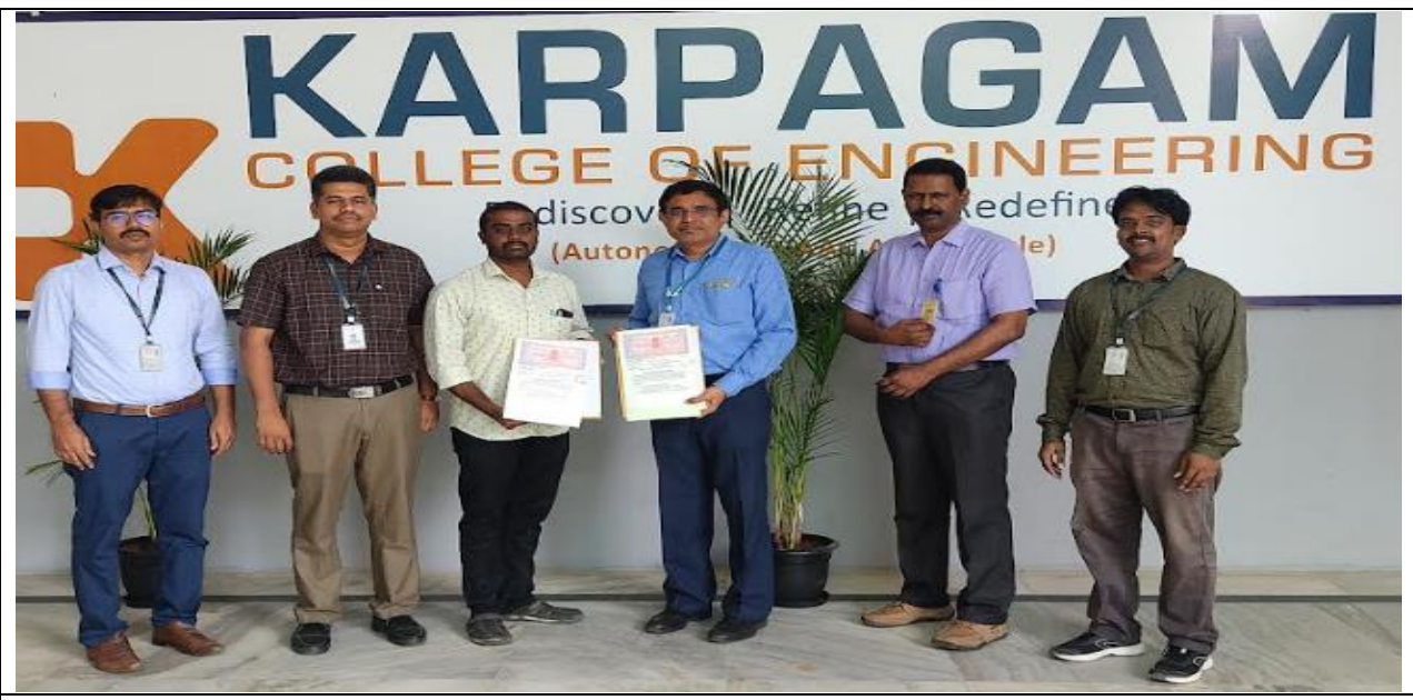
Fig.3: MoU signed between Karpagam College of Engineering and SA Builders, Coimbatore on 18<sup>th</sup> August 2023

Signed MoU with SA Builders, Coimbatore on 25<sup>th</sup> September 2023.