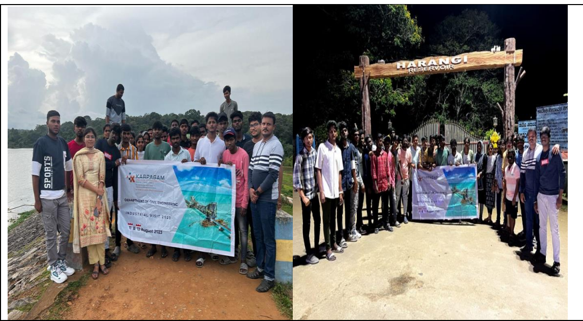
Fig.7: Third year civil engineering student visited the Chilihole reservoir and Harangi dam, located at coorg, Karnataka on 11<sup>th</sup> & 12<sup>th</sup> August 2023.

Department of civil engineering organized an industrial visit for the students of third year to Chilihole reservoir, Coorg and Harangi dam, Coorg on 11<sup>th</sup> & 12<sup>th</sup> August 2023.