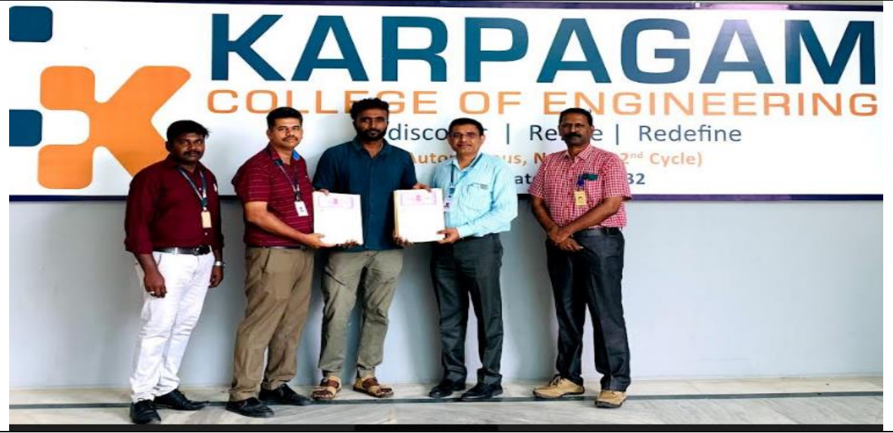
Fig.1: MoU signed between Karpagam College of Engineering and Digital Land Surveying, Coimbatore on 18<sup>th</sup> August 2023

Signed MoU with Digital Land Surveying, Coimbatore on 18<sup>th</sup> August 2023.