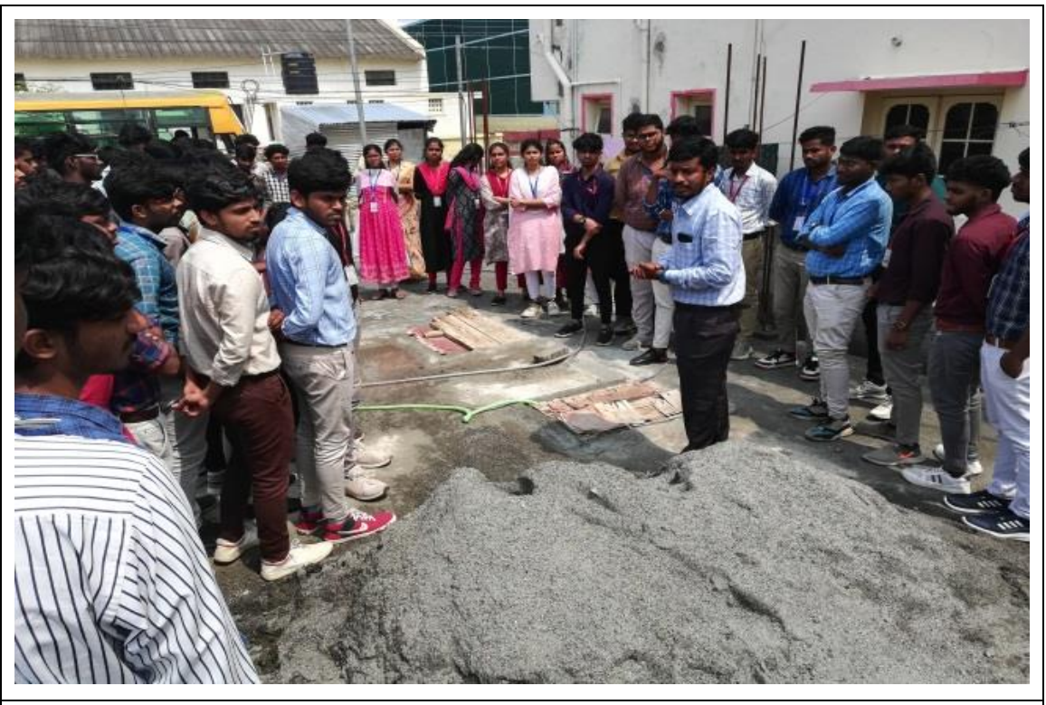
Fig.9: Third year civil engineering students visited an ongoing construction site located at peelamedu, Coimbatore which is constructed by JAS associates.

Department of Civil Engineering organized a local visit to JAS Associates, Coimbatore on 18<sup>th</sup> October 2023.