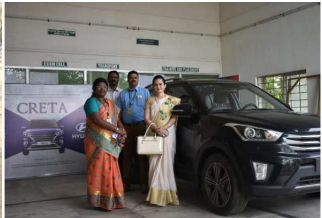
HYUNDAI CRETA CAR