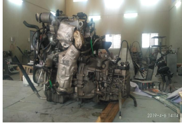
XUV 300 and TUV 300 PETROL ENGINE